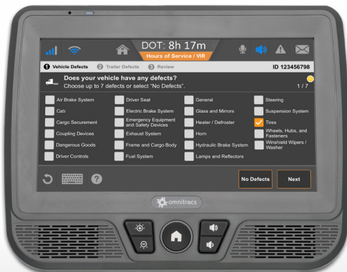
Driver vehicle inspection report on IVG